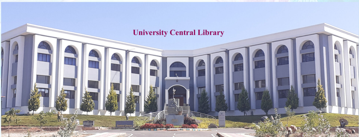
University Central Library