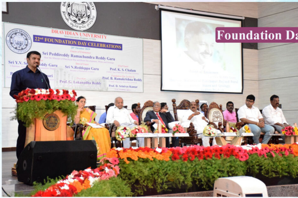
Foundation Day Celebrations - 2019