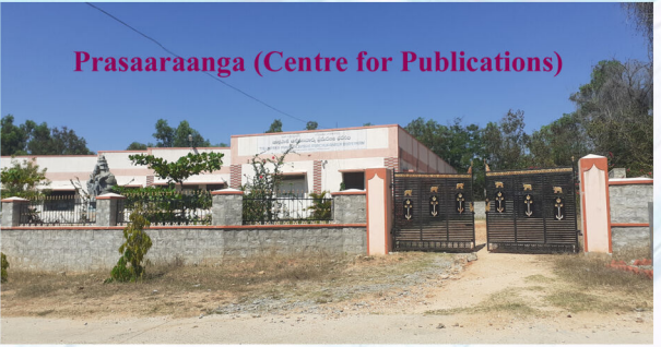
Prasaaraanga (Centre for Publications)