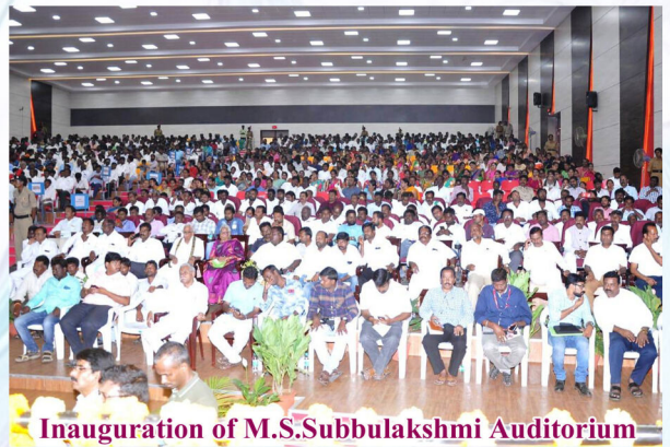
Inauguration of M.S. Subbulakshmi Auditorium