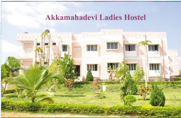
Akkamahadevi Ladies Hostel