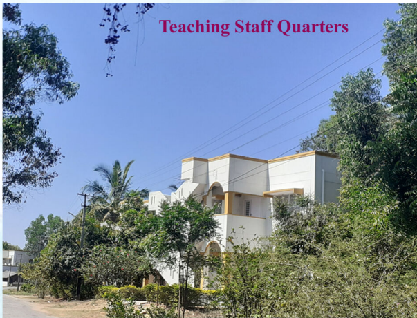
Teaching Staff Quarters