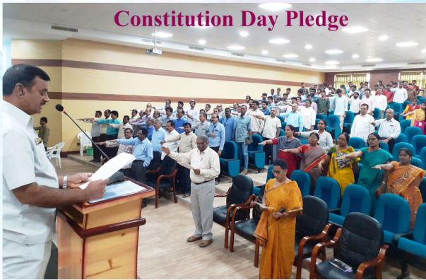
Constitution Day Pledge