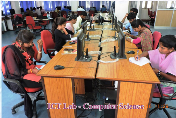
ICT Lab - Computer Science 16-11-29