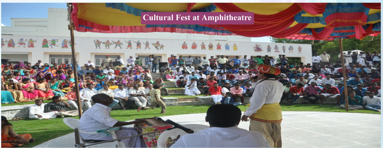
Cultural Fest at Amphitheatre