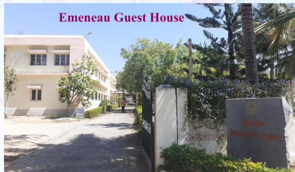
Emeneau Guest House