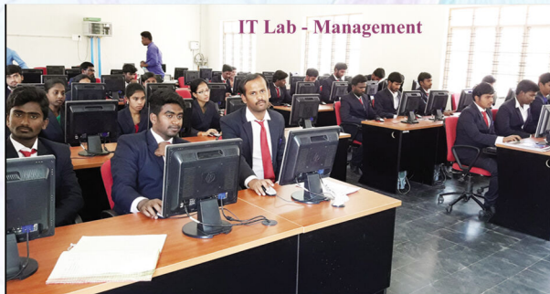
IT Lab - Management