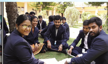
Learning in Groups