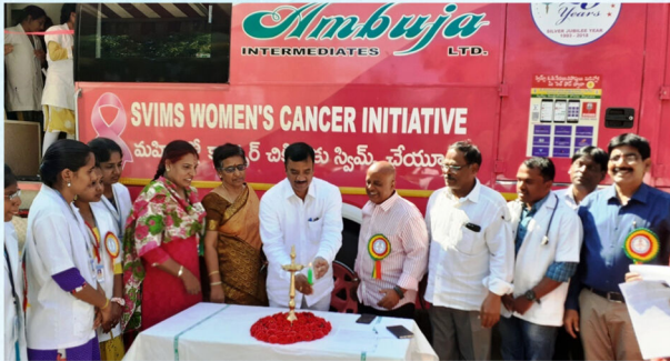
Ambuja INTERMEDIATES LTD. SVIMS WOMEN'S CANCER INITIATIVE మహిళా కు సహాయ చేయండి